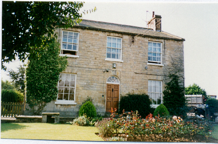
Low Mills Farm